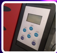
Simple Operation Panel