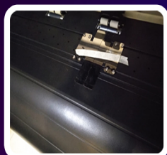
The Machine Platform